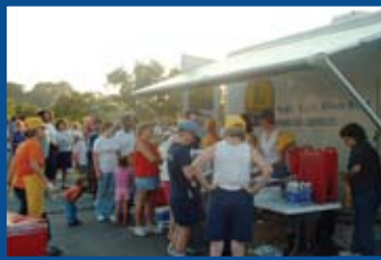
A feeding line at one of the Mass Feeding Units