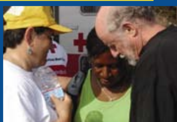
Disaster Relief offers care for body, mind, and spirit.