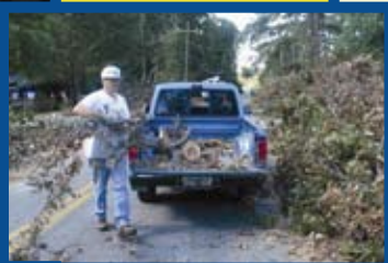
A Disaster Relief volunteer helps with the removal of fallen trees.