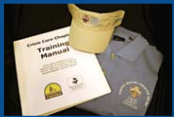
All Crisis Care Chaplains receive formal training on how to effectively communicate with and comfort victims of disasters.